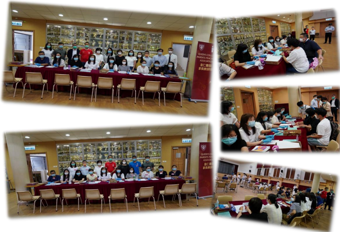
S1 Registration and New Members Recruitment