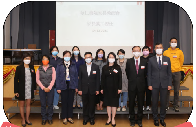
中五家長義工 S5 Parent Volunteers