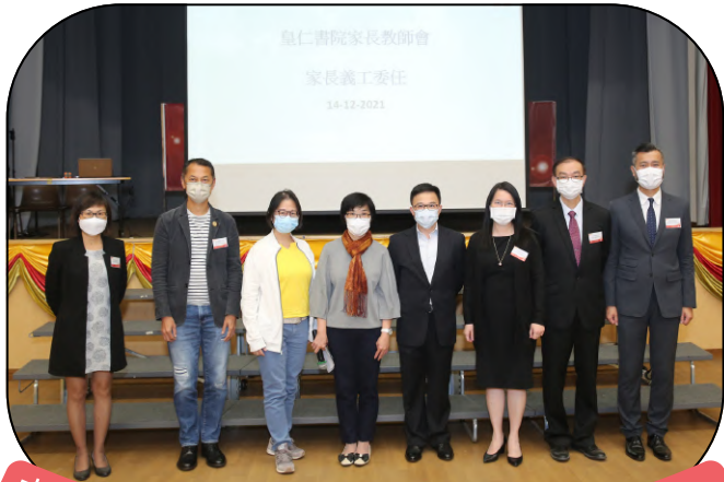
中六家長義工 S6 Parent Volunteers

Parent Volunteers Appointment Kick-off Ceremony