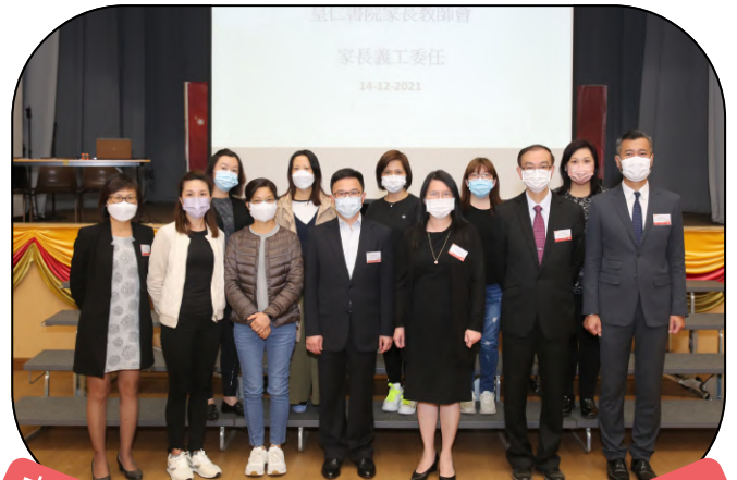
中三家長義工 S3 Parent Volunteers