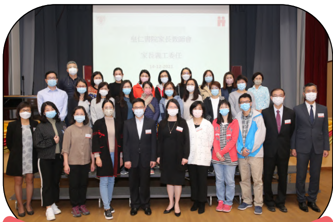
中二家長義工 S2 Parent Volunteers