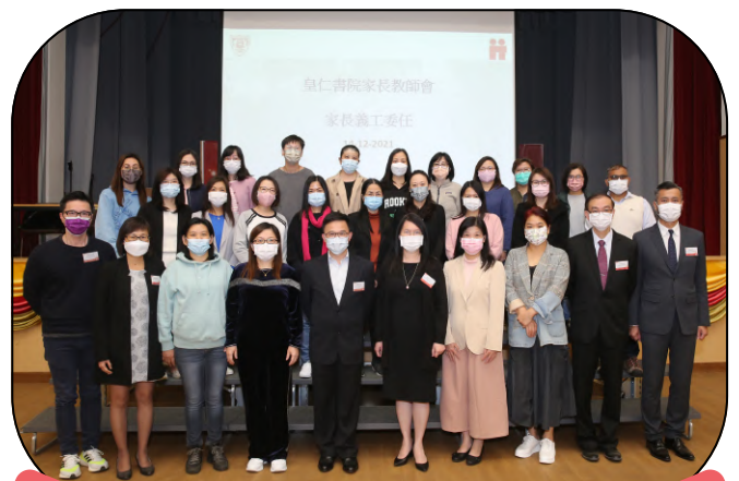
中一家長義工 S1 Parent Volunteers