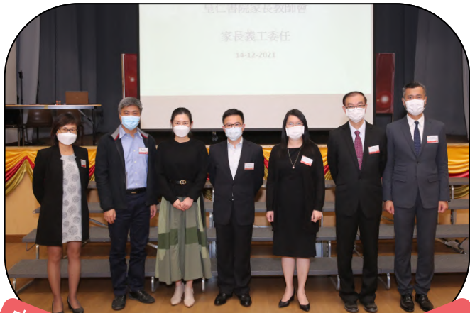
中四家長義工 S4 Parent Volunteers